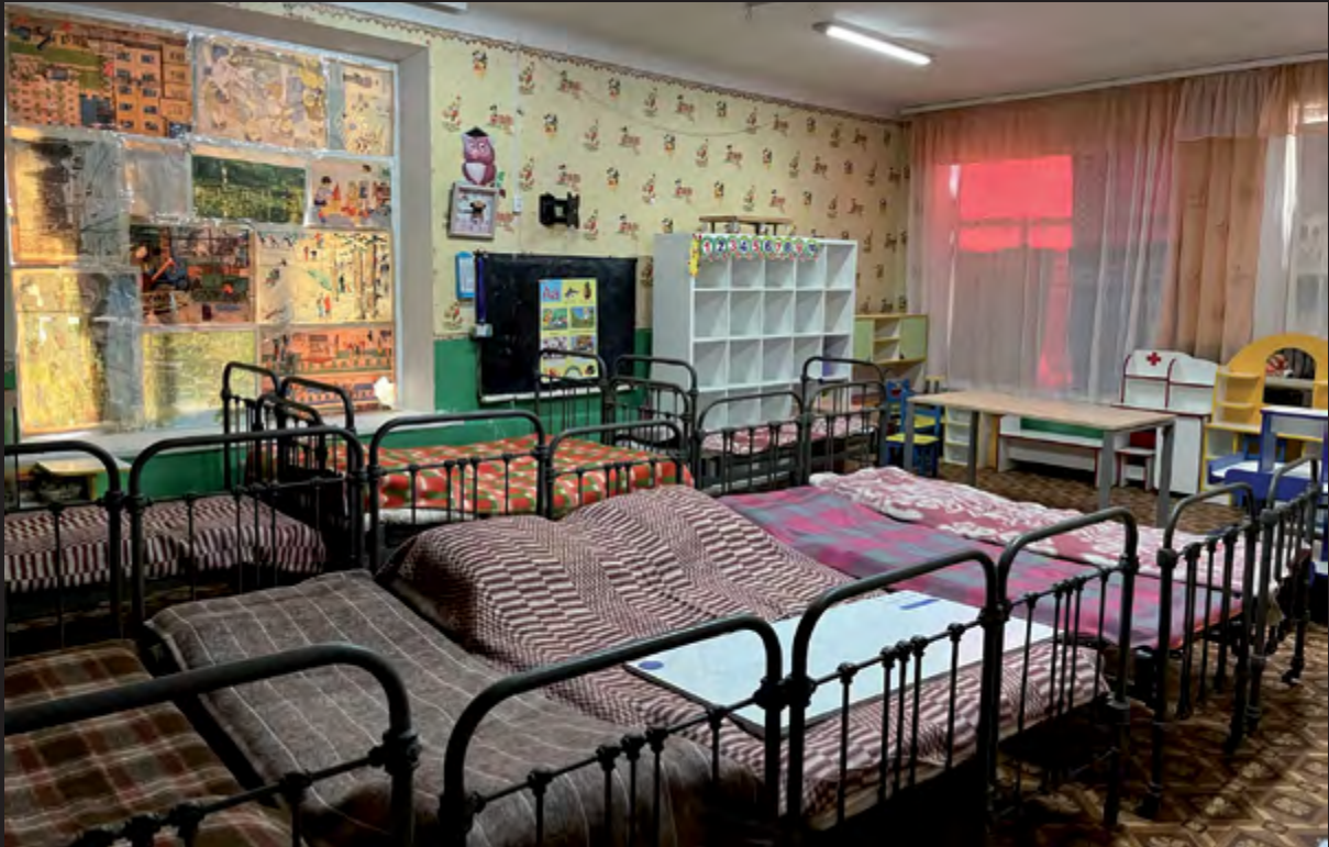
👁️ ↑ A nursery school that has been adapted into a shelter for displaced people in Kharkiv region, Ukraine.