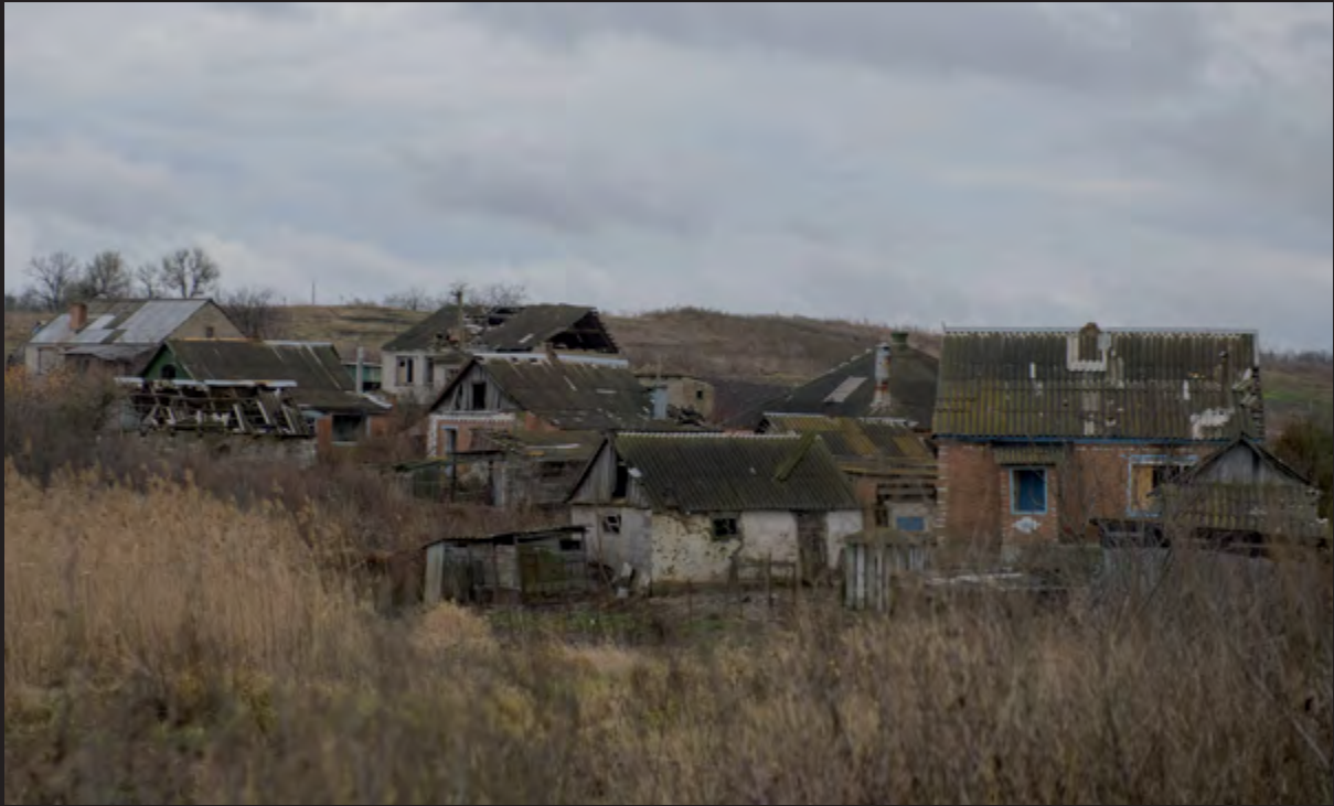
↑ Mala Komyshevakha, the sisters' home village in Ukraine's eastern Kharkiv region, which was almost totally destroyed during Russia's full-scale invasion.