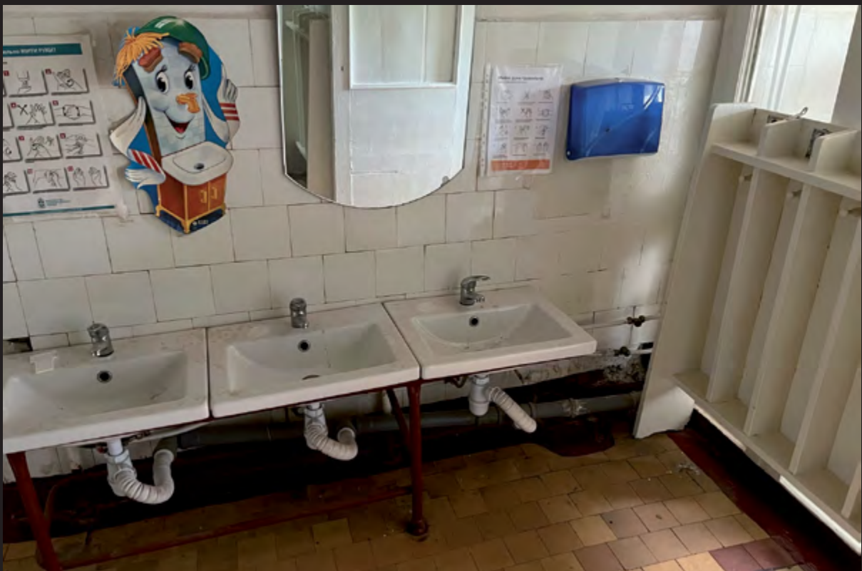
👁️ ↑ A bathroom facility in a temporary shelters for displaced people in Kharkiv, Ukraine. Shelters, which are often in schools or nurseries, often do not have physically accessible sanitation for people with disabilities.